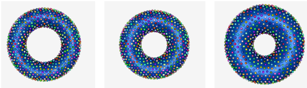
Figure 2: an illustration of correspondences on a few tori from example population

Next, we will initialize and optimize correspondences on the tori, using the distance transforms as input. Fig. 2 displays example tori shapes with resulting correspondences overlaid as circular glyphs.